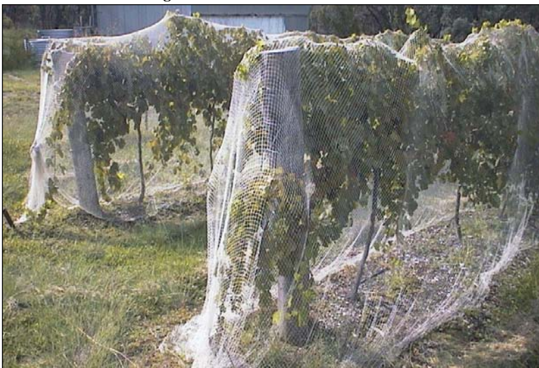
Throw-over Vine netting

The NetPro Group are leaders in the design and construction of Protective Canopy Systems. Our collective experience is immense, providing you with: Custom-designed solutions through one-on-one consultation Extensive and ongoing research & product development Staff field knowledge and expertise Warranties on workmanship and products